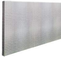
ZR Micro Twin V 2.0