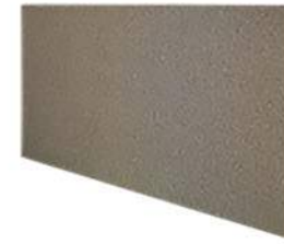
DAP V 2.0