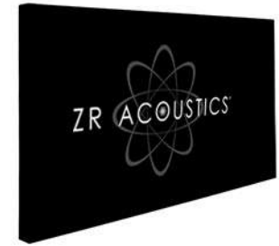
NEW ZR Product!