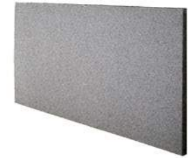
DAP V 3.0