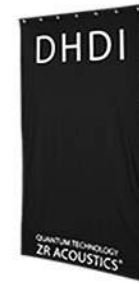
ZR Micro Screen