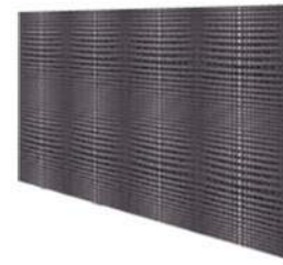
ZR Micro Twin V 3.0