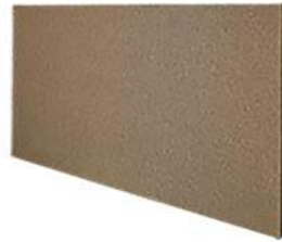
DAP V 1.0